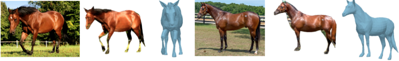
Figure 2: Application to horses. Horses not used for training.