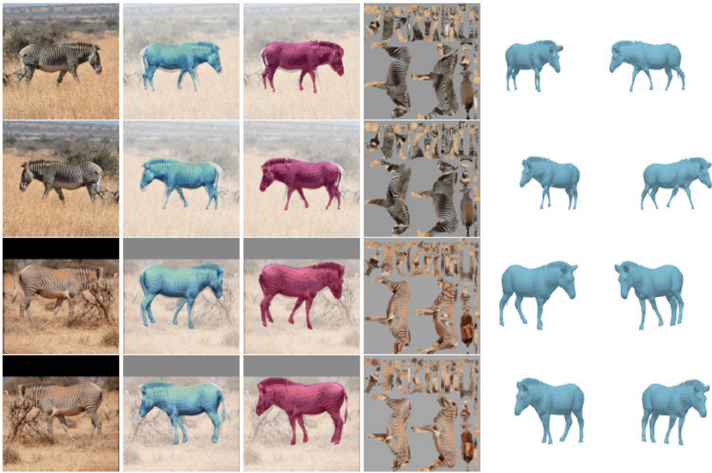
Figure 1: Results on test set.